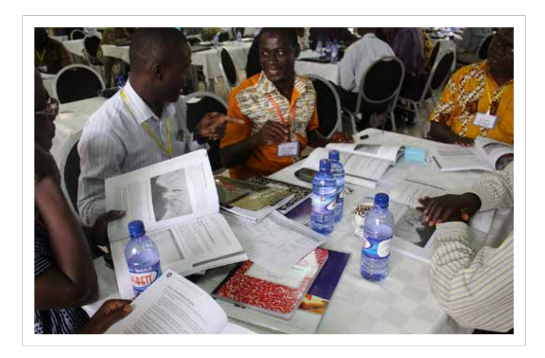
Figure 2. Tutors are using the PD Guide to plan

In this activity, if you find that you have a lot of time, you could ask some of the groups to rotate, so that each each group experiences each game. (This will depend on the number in your PD group and how you manage your time).