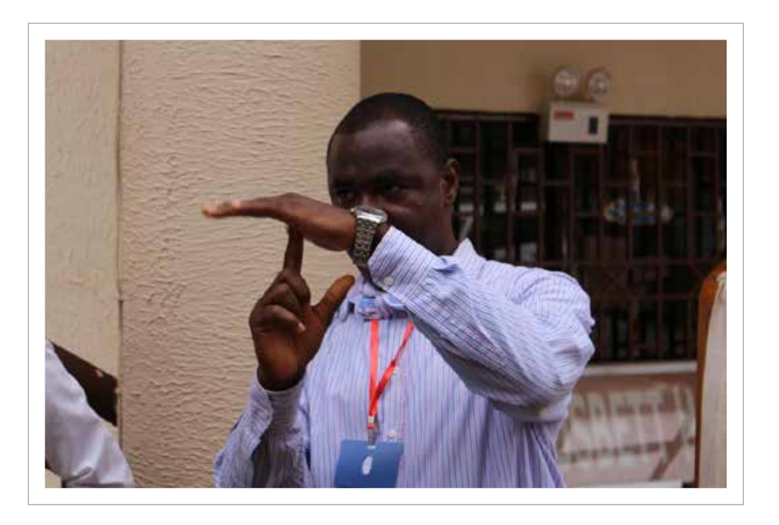
Figure 8. It is important to keep time.