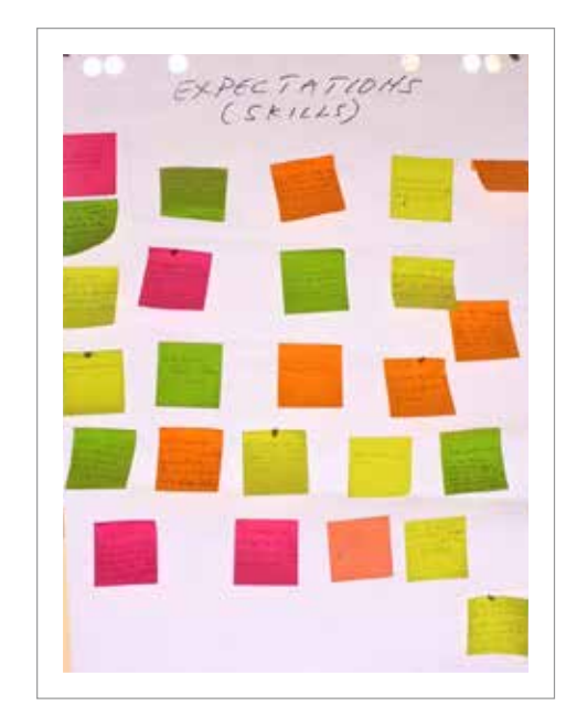
Figure 1. Tutor expectations recorded at the inception workshop

For this activity you will need either 'Post-it notes' or strips of paper you prepared earlier. These will be stuck on the wall later.