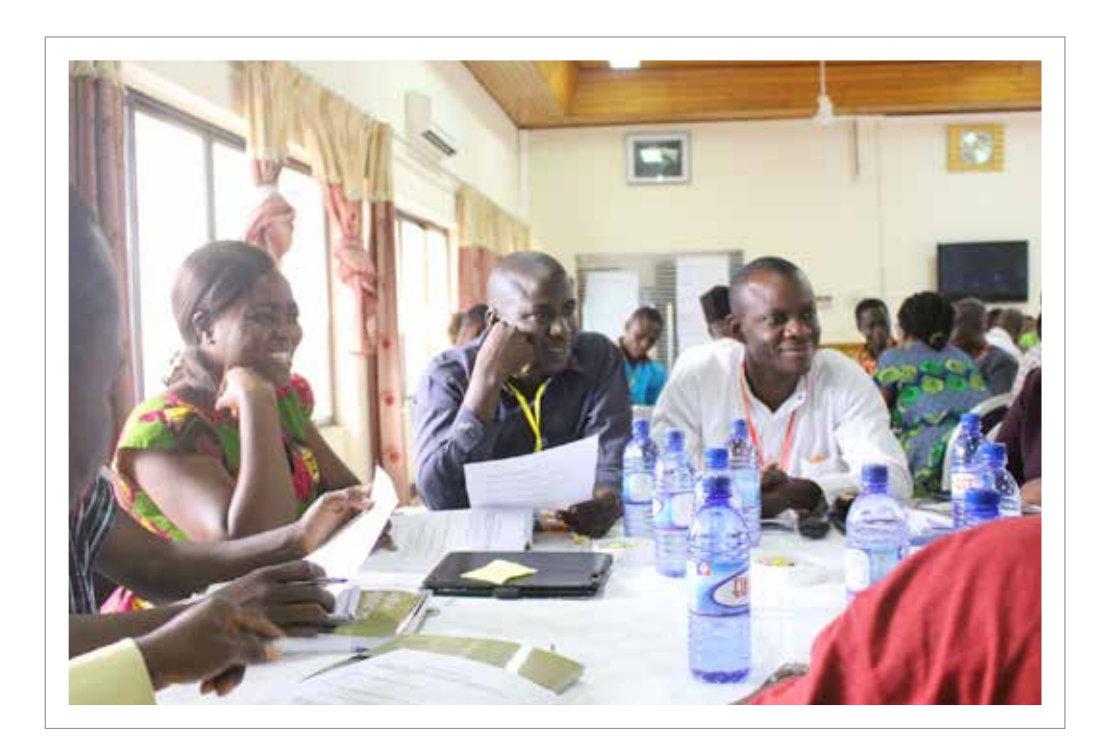
Figure 7. Tutors listening to a reflection